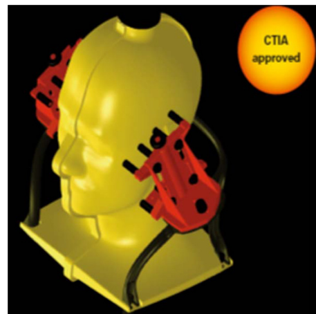
Fig. 2. SAM Phantom. The red devices are clamps to hold the cellphone in a specified location. “CTIA” is the Cellular Telecommunications Industry Association.

A study of temperature controlled human sperm placed 3 cm beneath a laptop computer connected to Wi-Fi for 4 h [39] reported, “Donor sperm samples, mostly normozoospermic [normal sperm], exposed ex vivo during 4 h to a wireless internet-connected laptop showed a significant decrease in progressive sperm motility and an increase in sperm DNA fragmentation.” The study concluded “Ex vivo exposure of human spermatozoa to a wireless internet-connected laptop decreased motility and induced DNA fragmentation by a nonthermal effect. We speculate that