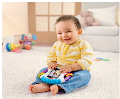
Fig. 3. An iPad placed within a rattle. Note the device is immediately over the boy's testicles.

Digital dementia also referred to as FOMO (Fear Of Missing Out) is a real concern. A science publication's review