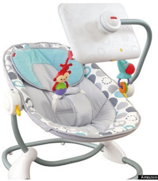
Fig. 5. An iPad for entertaining a baby.

article describes the problem in great depth [45]. An empirical study of the problem was published in 2013 [46].